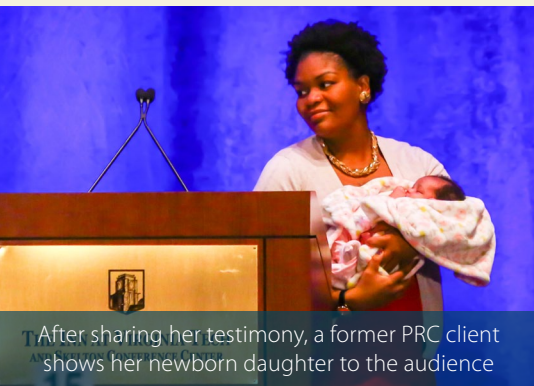
After sharing her testimony, a former PRC client shows her newborn daughter to the audience

Attendees enjoyed two blessed evenings of conversation, challenge, and inspiration. The event included a meal catered by the Inn at Virginia Tech, a ministry update, client testimonies, a LifeSponsor testimony, and an inspiring message from our keynote speaker, Star Parker. Between the two nights, we had 536 guests, and raised more than $244,000 for the PRC ministry! The event was truly a celebration of how God uses the PRC ministry to support and preserve His breath of life .