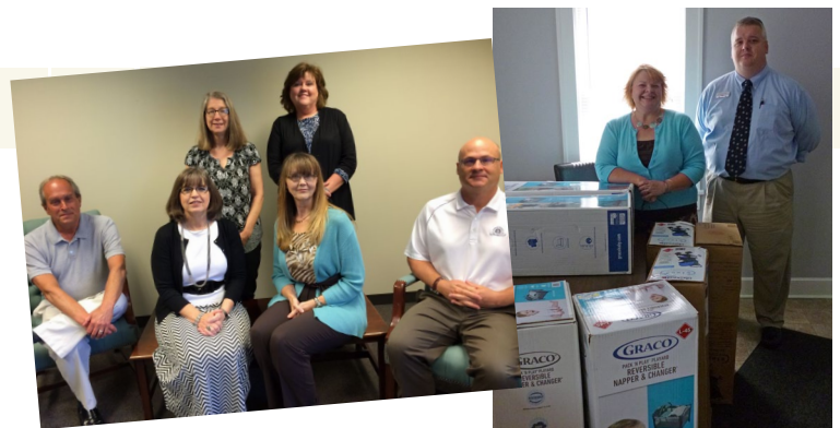
The Blacksburg BB&T branch members that volunteered in the clinic.