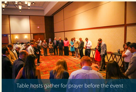
Table hosts gather for prayer before the event